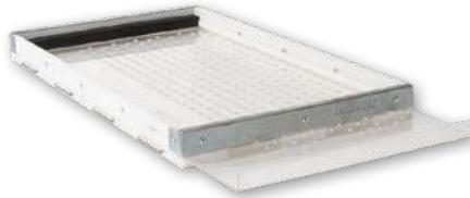
Paperpot Seeder Frame 7953 ⓘ

Drop seeder system comprised of interchangeable plates that sit within a frame. Clear plexiglass plates for easy alignment over Paperpot cells. Only compatible with 264 cell Paperpot trays and chain pots. Frame and plates sold separately.