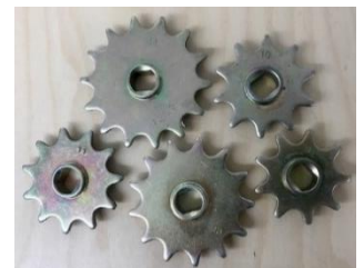
Assorted Jang Sprockets.

Each Jang JP Series Seeder comes with a set of 6 numbered sprockets (#9, #10, #13, #14, and two #11) to adjust your seed spacing. The number correlates with the number of teeth on each sprocket. To operate your Jang JP Series Seeder, a sprocket must be mounted onto each of the drive shafts located both at the front and the rear of the gear box with a chain connecting the two.