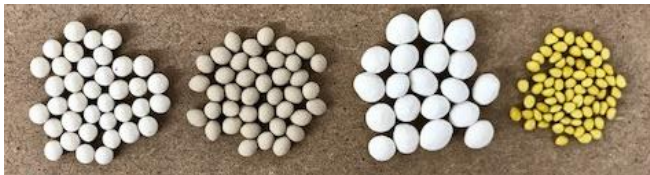
Different sizes and shapes of pelleted seeds.

Note: Some roller types have the same size holes, but the depths are different. For example, an R roller and a G roller both have 9mm diameter holes, but the G roller is a little deeper.