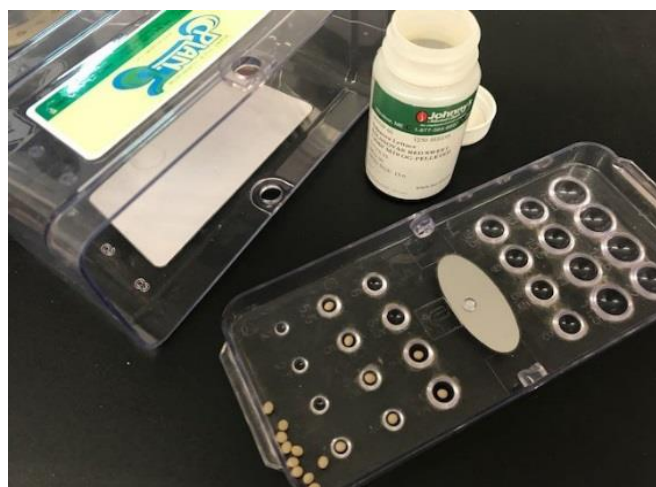
Pelleted seed shown in the seed size gauge.

Next, you will need to determine the size of the seed being sown. The Jang JP Series Seeders are equipped with a seed size gauge on the lid of the hopper (see right). This gauge shows hole sizes (width in mm). Using the largest seed you can find of your chosen variety, test it in each size hole until you find one where the seed sits loosely inside. This exercise is helpful for approximating what roller size you will need. Next, test the seed in the roller that has the closest hole size and adjust up or down as necessary. See the chart on the next page for roller hole sizing.