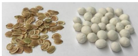
Raw and pelleted parsnip seed.

Knowing your seed shape might also influence your seed buying decisions. For example, parsnip seed (see left) is very flat and often becomes tangled in the brush of the Jang JP Series Seeders, making it difficult to sow precisely. Therefore, many growers choose to buy pelleted seed for mechanical seeding.