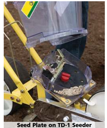
Seed Plate on TD-1 Seeder