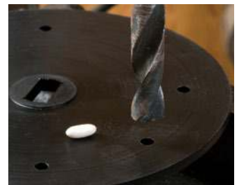
Drilling a #7016 blank plate